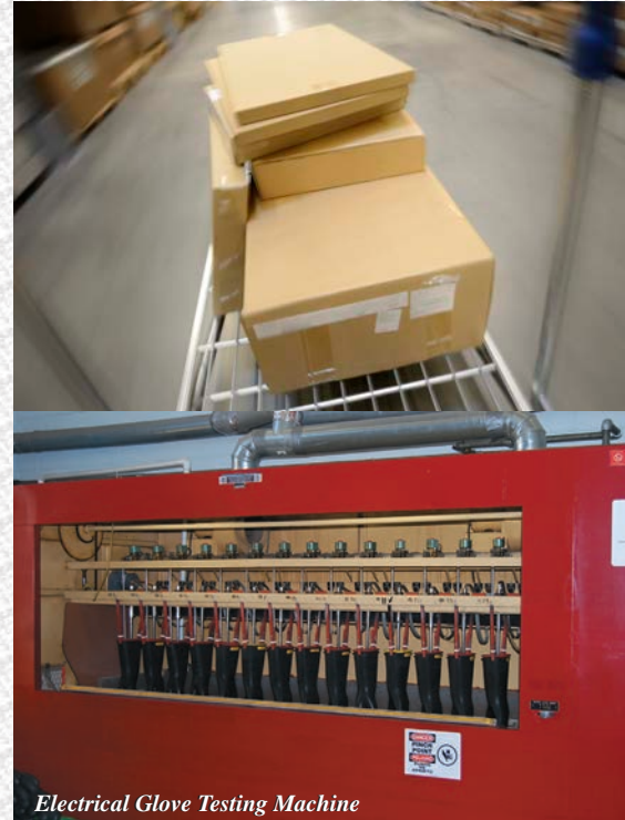
Electrical Glove Testing Machine